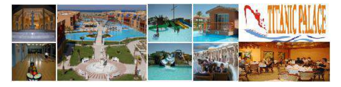
Sahl Hashish Road – P.O. Box 45, Hurghada, Red Sea, Egypt

The hotel offers free access at our nearby sister hotel Titanic Beach. You can use the recreational, food and beverage facilities including the specialty ala Carte Restaurants upon prior reservation with guest relation desk.