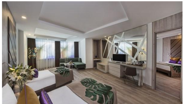
BE Family B