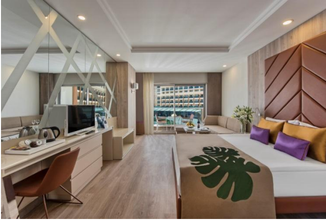
BE Family A