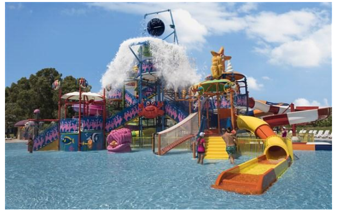
Water Slides for Adults and Children