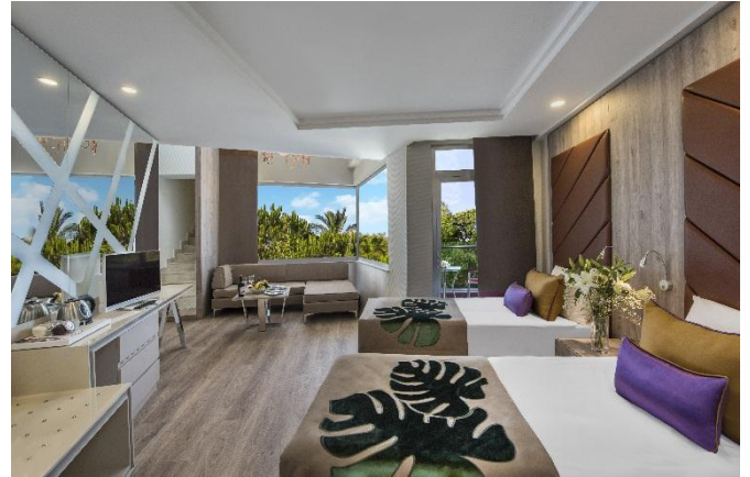
BE Family Loft

BE FAMILY A: in total 110 rooms, each family rooms is 56 m 2 and is consisting of 2 rooms. In the parents rooms is 1 french bed, 1 Sofa, in the children room are 2 Single bed (Maximum Accommodation: 4+1 or 3+2). In the rooms there are Balcony, 1 Shower / WC, air conditioning (central and between certain hours), hair dryer, direct dial telephone, LCD TV (satellite), music, safe, mini bar, Laminate, kettle, tea and coffee. Every day housekeeping, towels are changed every day, sheets are changed every 2 days 1 time. The rooms have Side Sea View.