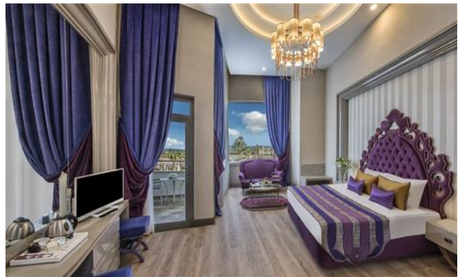
BE Delux Loft

BE ROMANTIC: in total 56 rooms, each room is 32 m 2 . In each room is 1 french bed (Maximum Accommodation: 2 adults). In the rooms there are Balcony, shower / WC, air conditioning (central and between certain hours), hair dryer, direct dial telephone, LCD TV (satellite), music, safe, mini bar, Laminate, kettle, tea and coffee. Every day housekeeping, towels are changed every day, sheets are changed every 2 days 1 time. The rooms have Side Sea View or Land View.