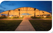
Fish Inn Restaurant