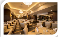
Mood' s Main Restaurant