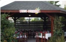
A'la Carte Restaurant