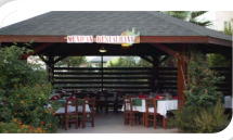
A'la Carte Restaurant