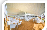
Beach Snack Club