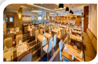
Delizia Main Restaurant